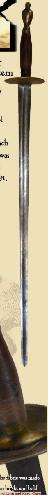
Hanger 1760 Pattern

The name 'Tory' was derived from the Irish word tóraidhe , which meant 'outlaw.' Both, Loyalists and Tories were those who remained loyal to Great Britain. But whereas Loyalists tended to remain neutral, the Tories actively fought against their Patriot neighbors ~ usually by guerilla tactics.